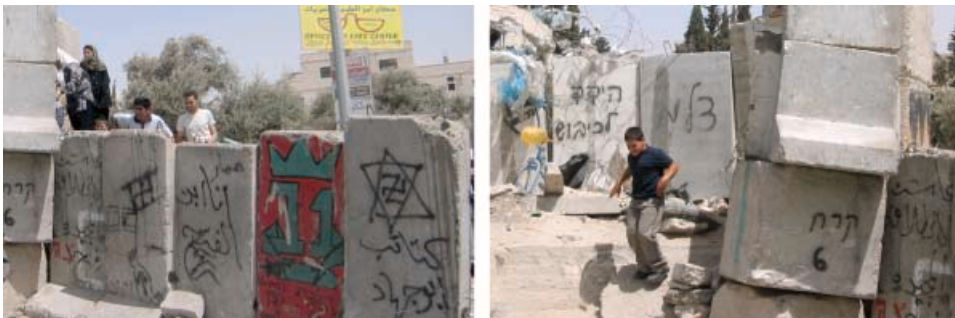
Figures 4 and 5. Parameters of indistinction and the ‘inside’ and ‘outside’ of physical barriers. Wall cutting the suburb of Abu Dis from Jerusalem: resistance and transgression.

The consequence of the state of exception goes beyond the spacio-cidal project. The political project of the Palestinian people is transformed into distinct population groups who become antagonists in the pursuit of their own interests vis-à-vis the conflict and its potential resolution: it is in the interest of the Palestinian residents of Jerusalem to stay outside the Palestinian national project (for accessibility to the Israeli labor market and the benefit from the social and health system), as Israel transforms the latter into a collection of Bantustans which cannot compete with Israel; the geographical fragmentation of the West Bank and Gaza create two (or more) distinct entities with different populations animated by their own stereotypes