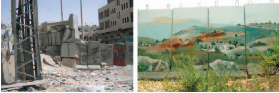
Figure 1. Two views of the wall of Gilo Settlement in front of Beir Jala: the painters draw on the wall (right) the same landscape of Beir Jala seen from Gilo but without figuring the Palestinians. To make the paintings more vivid, cats and dogs were added.

institutionalized invisibility of the Palestinian people both feeds and is fed by Israel's everyday settler-colonial practices. For example, parts of the Israeli West Bank wall are being constructed specifically to remove the visual presence of Palestinian villages such as the wall along the sides of Route 443 where there is no security function or those of Gilo Settlement in front of Beir Jala (Figure 1).