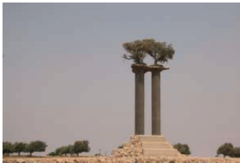
Figure 3. Israeli monument in a kibbutz near Jerusalem: two uprooted olive trees as a piece of art.

People have been forced to migrate internally as well. In Hebron, for instance, some 5,000 people (850 families) have left the Old City for neighboring villages